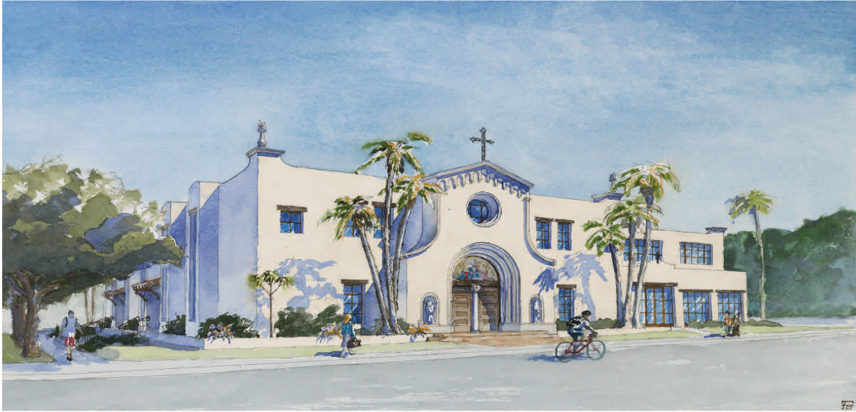
proposed St. Mark's church façade remodel